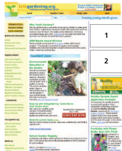
Banner advertising: ▲ kidsgardening.org

*ANIMATION: Please note — animated advertisements may not :