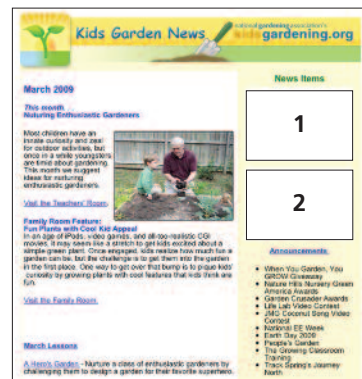
▲ Kids Garden News e-mail