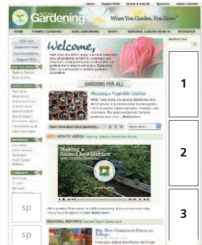
Banner advertising: garden.org ▲

NEW! BANNER ADVERTISING @ KIDSGARDENING.ORG: This is the premier Web site for educators and families who garden with youth. Your Web site advertising runs with NGA's extensive offering of youth gardening information, how-to articles, lesson plans, thematic explorations, grant opportunities, online curricula, and more. Site visitors are highly qualified educators, parents, and community leaders seeking ways to engage youth with gardening activities, nutrition education, and environmental stewardship. They respond with solid click-through and conversion rates for a variety of offers. Monthly advertising impressions range from 120,000-280,000.