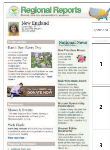
▲ Regional Reports e-mail

Advertising Rates: 1x – $2,750 /issue • 3x – $2,500 /issue • 6x – $2,250 /issue